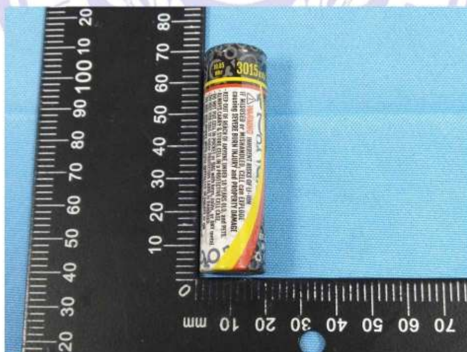
Photo 2 Rear 反面